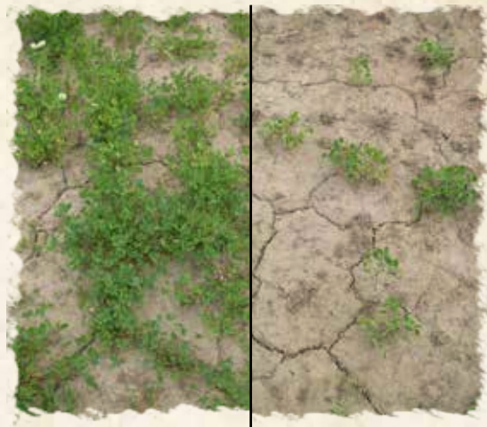
FIXATION BALANSA CLOVER VS. CRIMSON CLOVER

Broadcast seeding on unprepared seedbed 60 days after seeding (planted May 11, 2011).